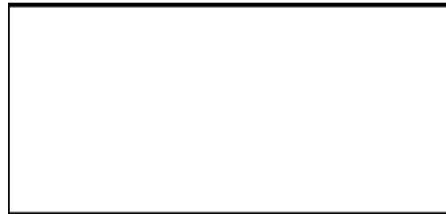
12"x24" (H) (P)