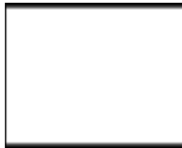
12"x12" Stair Tread (H)