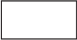
4" x 8" (also available in Bullnose)